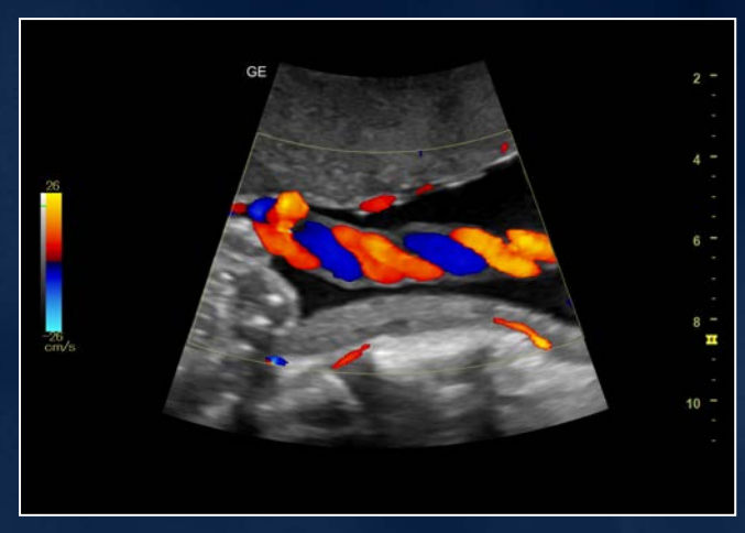
Umbilical cord with Doppler