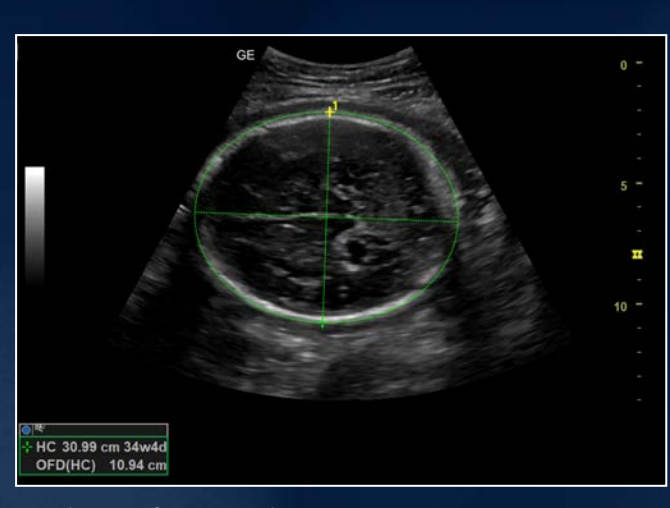
Head circumference with SonoBiometry