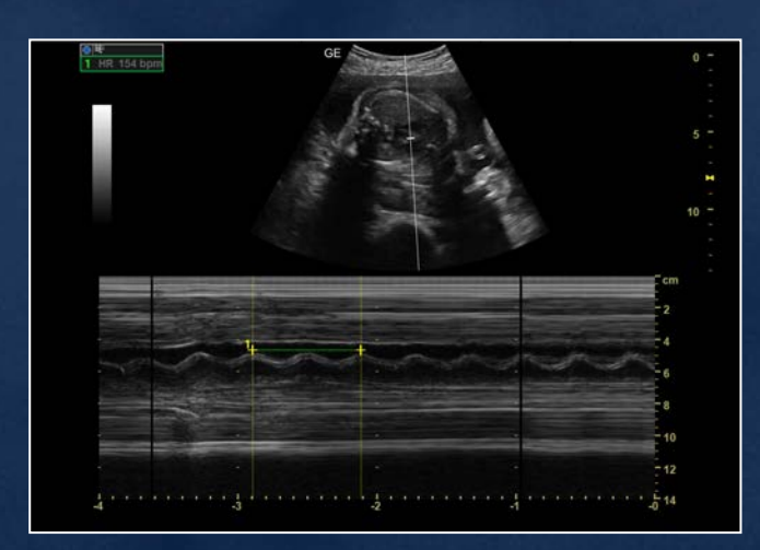
M-Mode fetal heart rate