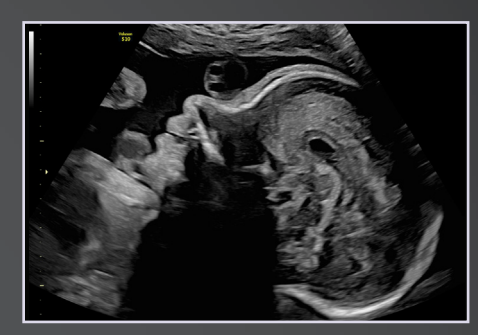
26 week fetal profile