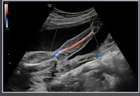
Vascularization of leg with HD-Flow<sup>™</sup>