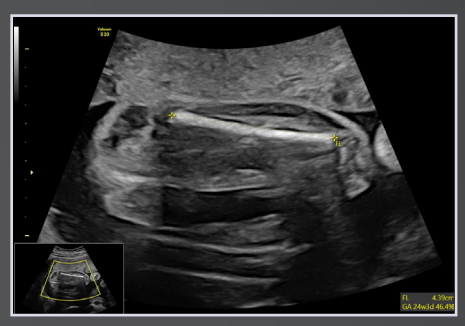
Femur length measured with SonoBiometry