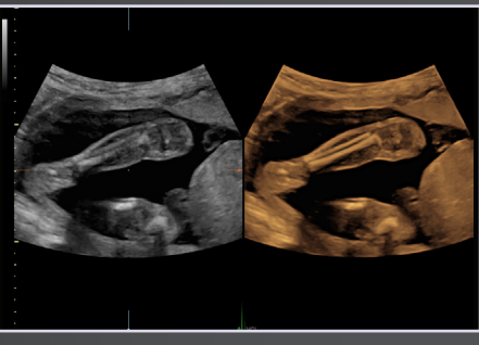
Lower leg with VCI-A