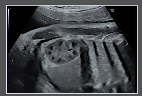
34 week fetal kidney