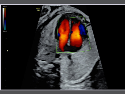
26 week fetal heart