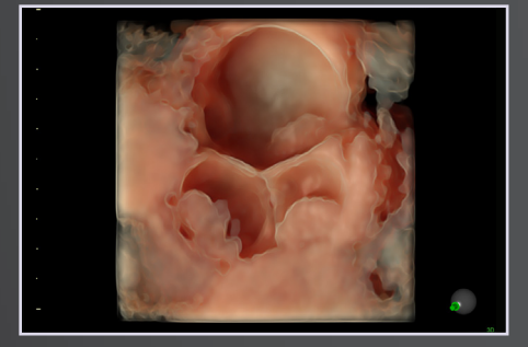
Complex adnexal mass with HD live Silhouette